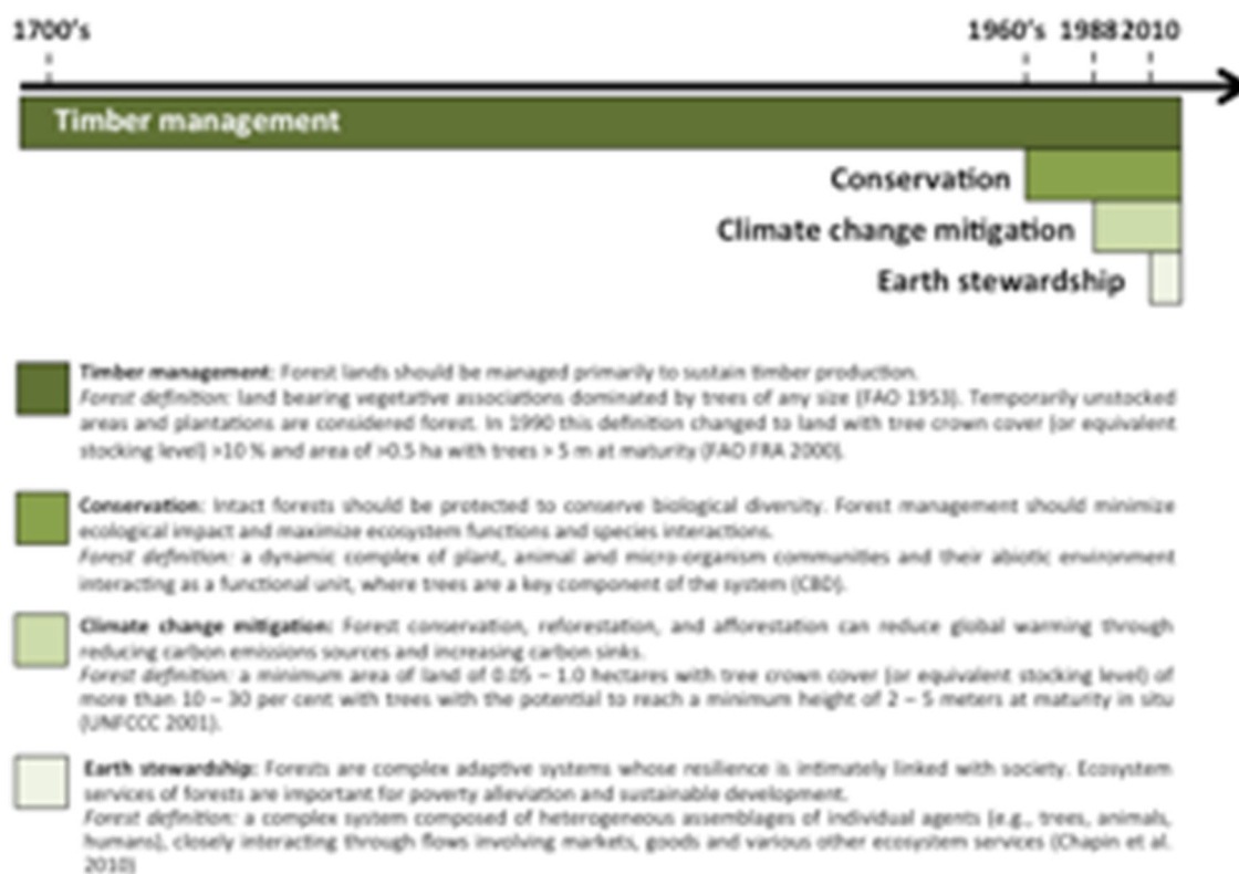
Fig. 2 Forest definitions emerge from prevailing objectives of use and management. Since the mid-twentieth century, forest management objectives and definitions have diversified, with new ones being added to earlier more entrenched and legitimized ones. Similarly, forest management policies have broadened their objectives, focusing not only on sustainable timber production, but gradually incorporating non-timber forest products, biodiversity conservation values, ecosystem services delivery, human well-being, landscape approaches, adaptive management, and socio-ecological resilience

Environmental movements arising in the 1960s generated new forest management objectives based on the ecological concept of forest as natural ecosystems (Figs. 1, 2), mobilizing individuals and newly formed national and international organizations to conserve nature and halt